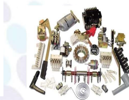
MoToR Spare Parts