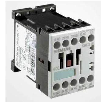
AC1 Duty Contactor