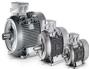
IEC Squirrel Cage Induction Motor