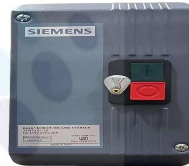
DOL Agriculture Strater