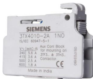
Auxiliary Contactor Block