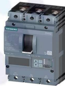
Molded Case Circuit Breaker