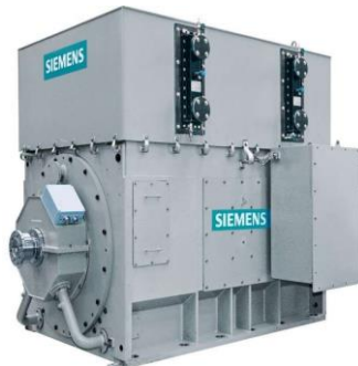
High Voltage Motor