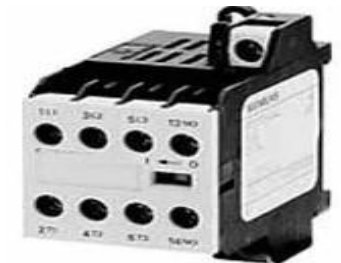
Accessories for 3RU/3RB Overload Relay