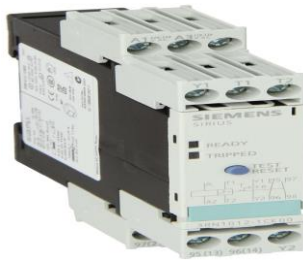
Thermistor Motor Protection Relay