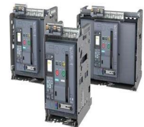
3VJ Air Circuit Breaker