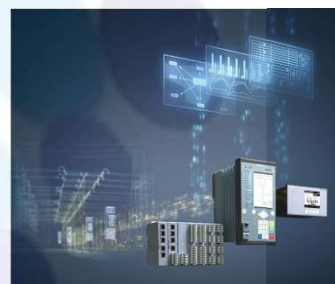
Energy Automation System