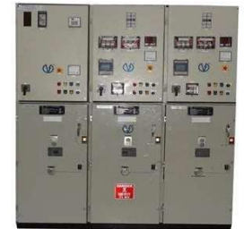
Vacuum Circuit Breaker Panel