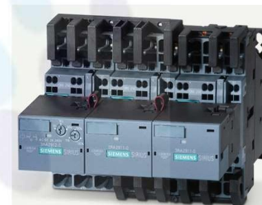
Star Delta Contactor