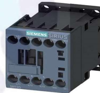
Power Contactor PLC Interface Relay