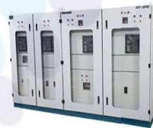
Switchgear Panel (Low/Medium/High)