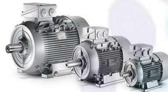
Low Voltage Motors