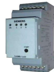
Water Level Controller