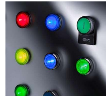
Push Button Indicator Lamps