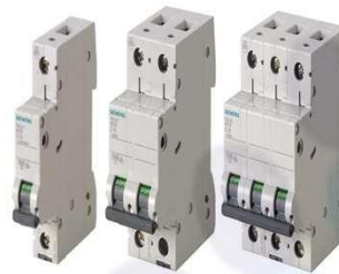
Miniature Circuit Breaker