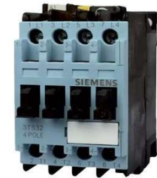
Converter Duty Contactor