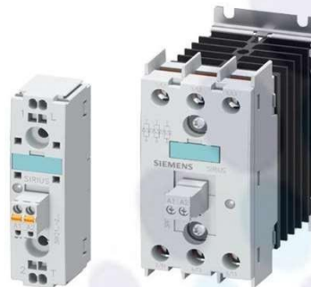
Solid State Switching Devices