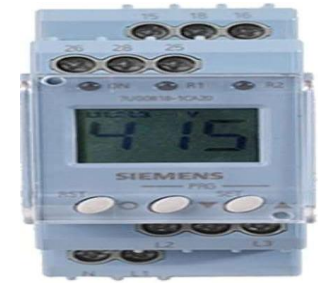
Line Monitoring Relay