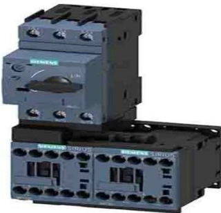
3RA Load Feeder