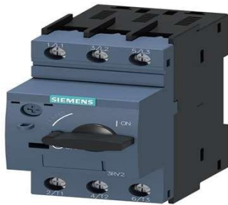
3RV Motor Protection Circuit Breaker