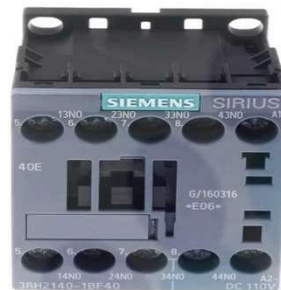
Contactor Relay with low power consumption coil