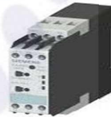
Insulation Monitoring Relay