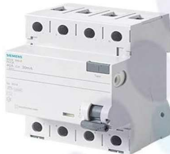
Residual Current Circuit Breaker