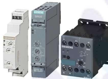
Timing & Monitoring Relay