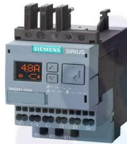
Current Monitoring Relay