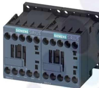
Latched Contactor Relay