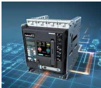
Air Circuit Breaker