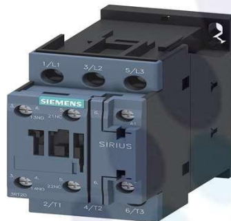
3RT Power Contactor