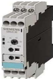
3RP Electronic Timer