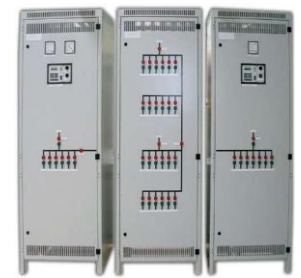
AC & DC Drive Panel