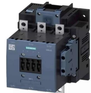
Power contactor with Remaining life Time indication