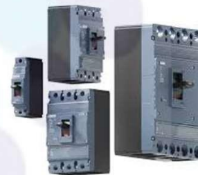
3VJ Molded Case Circuit Breaker