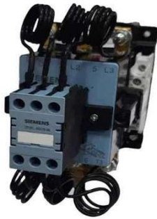
Capacitor Cuty Contactor