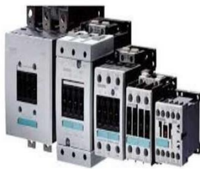
Low/High Voltage Switchgear