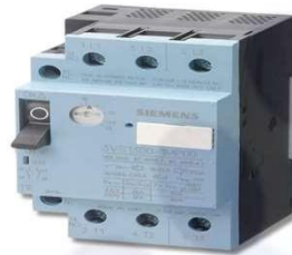
3VS MOTOR Protection Circuit Breaker