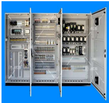
Special Remote Panel