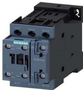
Energy Efficient Contactor