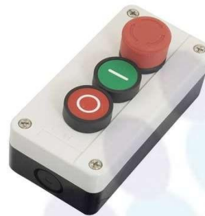
Push Button Station