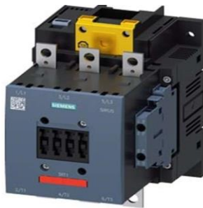
Power contactors- with fail safe input