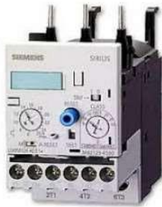
Microprocess Based Overload Relay