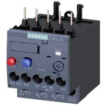
Thermal Overload Relay