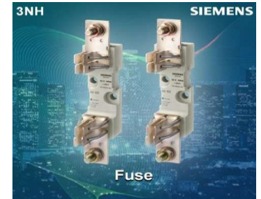
Fuse & Fuse Base