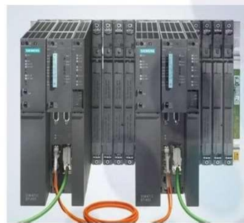
Programmable Logic Controller