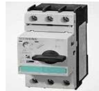
Motor Protection Circuit Breaker