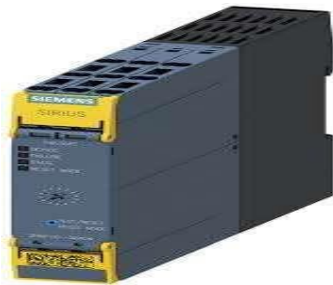
3RM1 Motor Starter