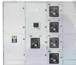
MCC Control Panel