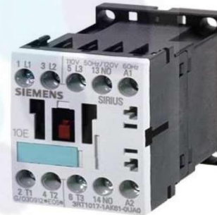
4 Pole Power Contactor;