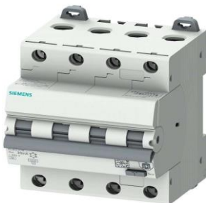
Residual Current Circuit Breaker with Overcurrent Protection