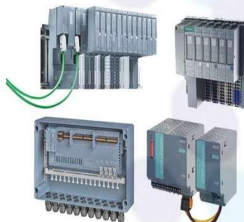
Remote I/O PLC