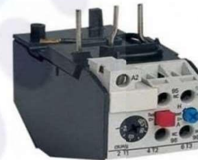
Accessories for Thermal Overload Relay 3UA/3UC